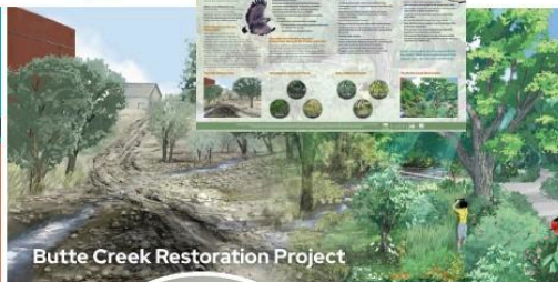
Butte Creek Restoration Project